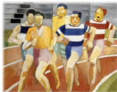
Les coureurs de Robert Delaunay (1924) Musée d'Art moderne de Troues - France

Pierre de Coubertin, historian and rugby referee, founded the International Olympic Committee (IOC) in 1894, before he became the renovator of the Olympic Games. The first Olympic Games of the modern era were held in Paris in 1924. One hundred years later, they return as Olympians from around the world compete for gold, silver, and bronze medals July 26 to August 11. The Paralympic (JPO) Games will follow from August 28 to September 8.