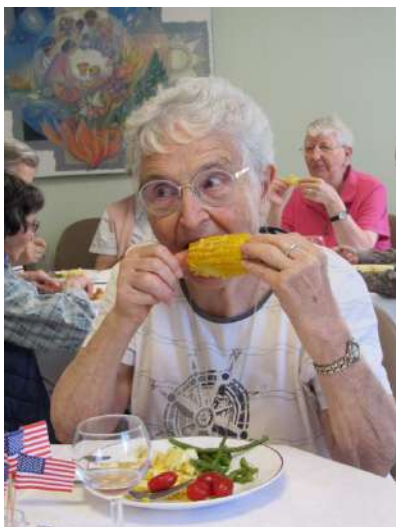
Eating corn-on-the-cob the first time