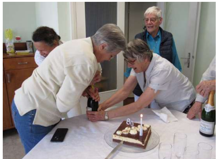
Struggling to open the celebratory sparkling wine