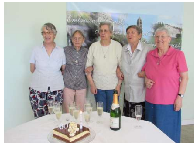
60 years of religious life