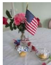
248 years as a nation